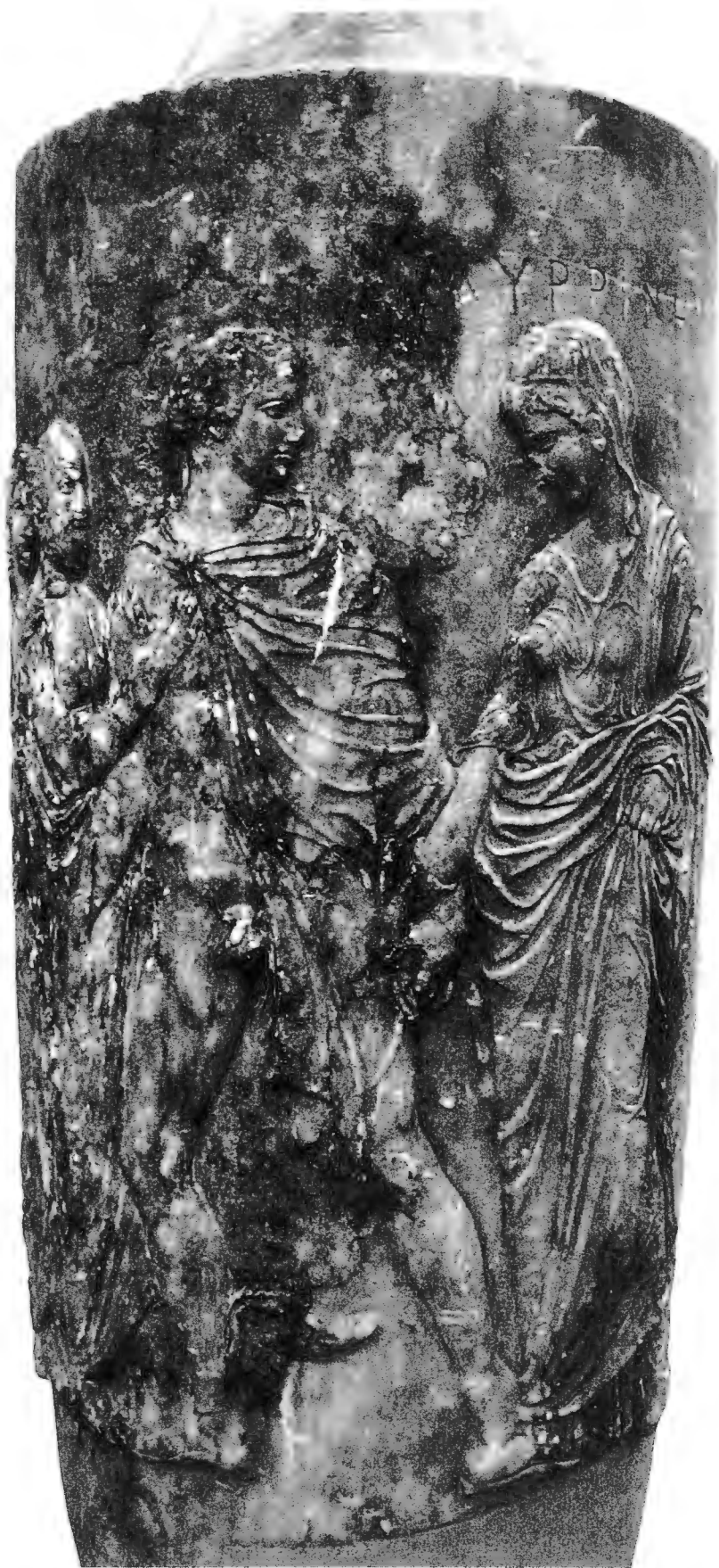
Figure 16. Funerary lekythos of Myrrhine. From Athens, Syntagma Square. Athens, National Museum 4485.