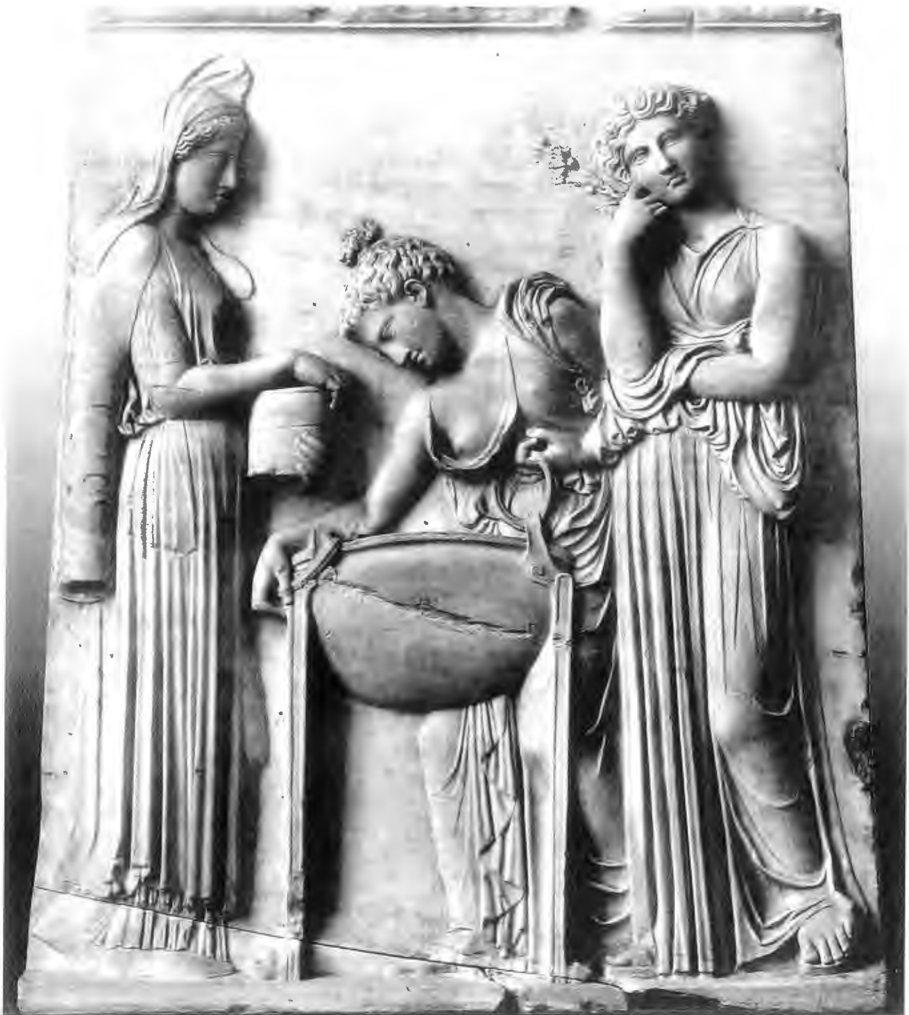
Figure 14. Three-figure relief of Medea and the daughters of Pelias. Berlin, Antikensammlung, Staatliche Museen – Preussischer Kulturbesitz Sk 925.

iconography is no obstacle. Herakles' close relationship to Athena is well known; Theseus was the Attic hero par excellence; Medea enjoyed a sojourn in Athens; Orpheus' continuous presence in fifth-century Attic vase-painting is a token of his popularity in Athens and of Athenian interest in Orphism. 82 It is probably no accident that one of the metopes of the temple of Apollo