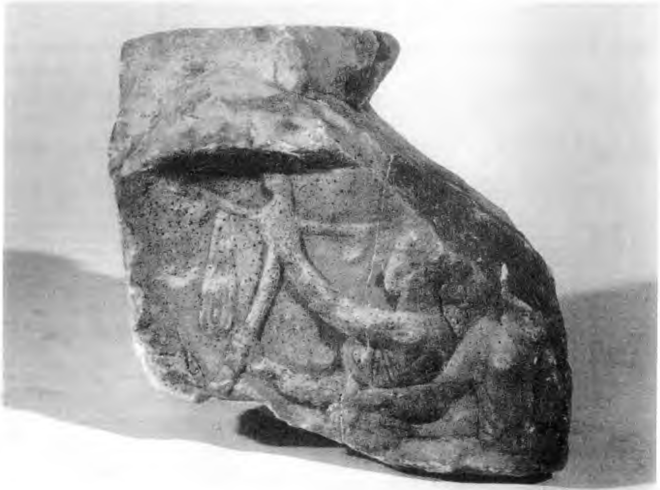
Figure 7. Fragment of statue base. Arrhephoros with warp peg alongside one of the Graces. Athens, Akropolis Museum 3306.

cult group, and Sokrates' is the only cult image of the Graces attested on the Akropolis. The question remains: if the relief with the Graces represented as half figures is based on Sokrates' original, why is not Hermes represented alongside them? It is possible that he was not part of the group but was a separate image, perhaps not even by Sokrates. Pausanias' phrase (1.22.8), "at the entrance of the Akropolis there is a Hermes named Propylaios, and the Graces, allegedly made by Sokrates, son of Sophroniskos," is ambiguous, and it is noteworthy that no other references to the Graces of Sokrates mention this Hermes.