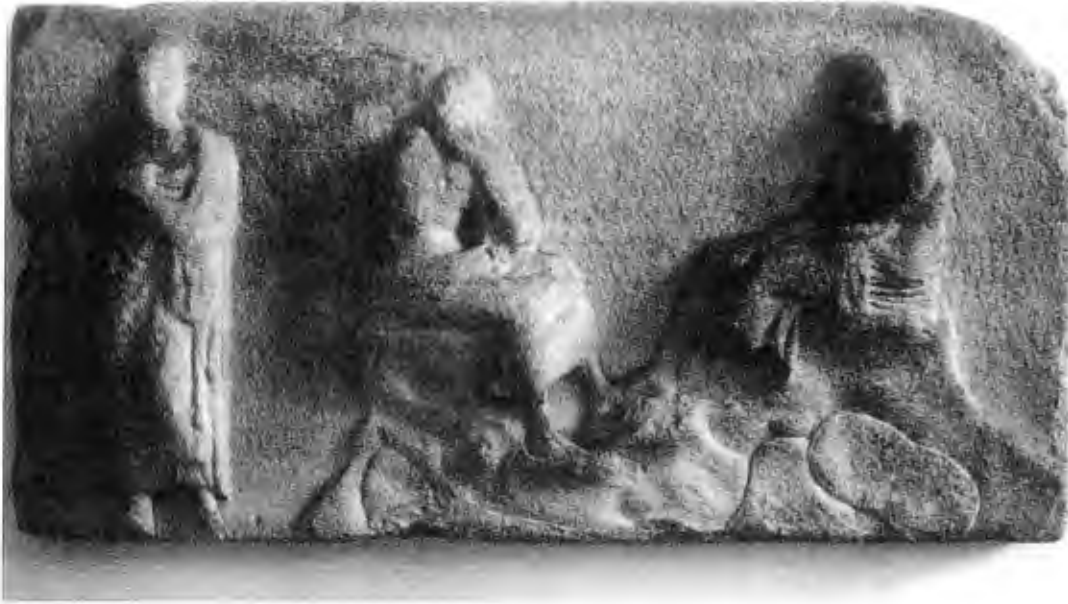
Figure 9. Slab B of the frieze of the Ilissos temple. Berlin, Antikensammlung. Staatliche Museen – Preussischer Kulturbesitz Sk 1483.

provisions, a crooked stick for carrying them, and a pilos-like object that has often been interpreted as a helmet but may be a bucket instead. 47 In the early twentieth century the pair was interpreted as Theseus and Peirithoos in Hades, and by extension slabs B and C were seen as parts of a Nekyia . 48 The two heroes in Hades, however, are usually shown as warriors, not as citizens in himatia; 49 I have argued elsewhere that the two men on slab B are initiates in the Underworld, resting on the banks of the Acheron River. 50 The reeds of the river may have been painted in the background. Even though it is not possible to prove that part of the Ilissos frieze carried an Underworld scene, 51 it remains a plausible interpretation, especially as the other surviving slabs, D and E, can be viewed as scenes of the Ilioupersis . 52 The iconography of the architectural sculptures of the Ilissos temple would thus be echoing Polygnotos' pictures at Delphi and would be rather appropriate decoration for a temple erected in the opening years of the Peloponnesian War. The representation of an Underworld scene would mark a new development in sacred architecture which remained, however, without following.