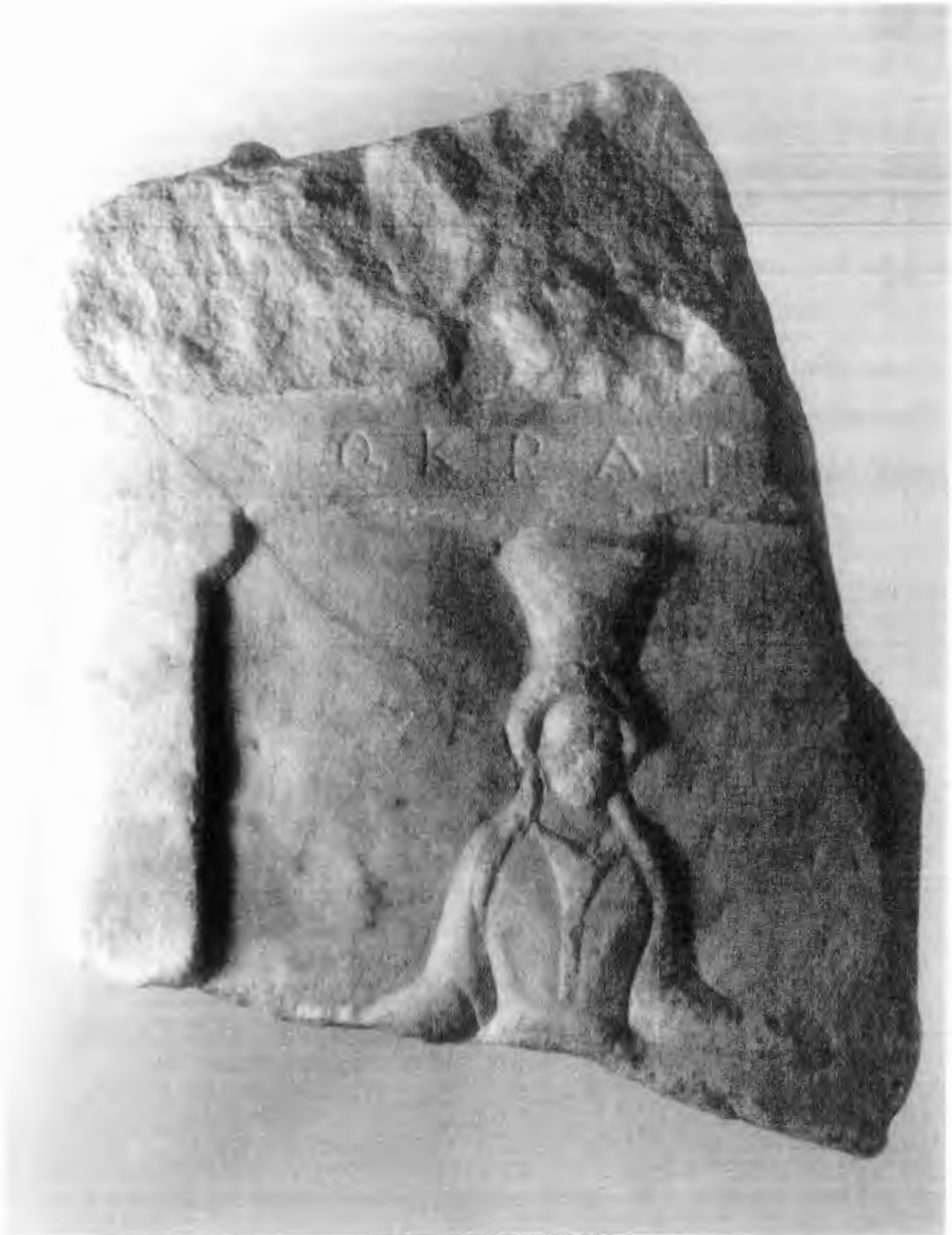
Figure 8. Fragment of document relief with one of the Graces. The name of the eponymous archon Sokratides is inscribed on the architrave. 374/3 B.C. Athens, National Museum 157.