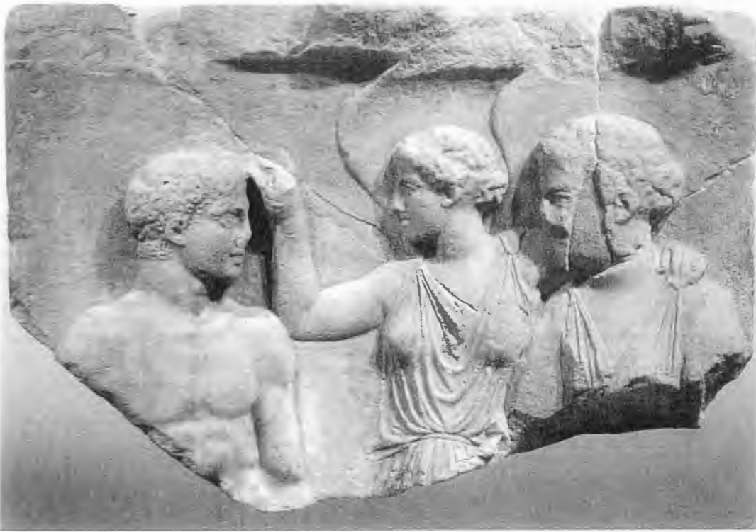
Figure 10. Fragmentary three-figure relief with Herakles, Nike, and Athena. Athens, Akropolis Museum 1329 (on loan to the Museum of the History of the Ancient Olympic Games, Olympia).

right hand must have accommodated a metallic wreath. Her clinging peplos is typical of the Rich Style and recalls the draperies of Nikai on the Nike temple parapet, whereas Herakles' muscular chest echoes Poseidon in the west pediment of the Parthenon. 55 Parthenonian overtones are also evident in the intimacy between the goddesses which finds a parallel in Nike and Hera on the Parthenon frieze, and in Herakles' furrowed brow that can be seen on some of the horsemen on the same frieze. 56 Nike's smaller scale and dependence on the larger goddess suggests that the crown is ultimately awarded by this other goddess. But who is she? Her identification with Hebe, suggested by a handful of scholars, does not explain Nike's gesture of intimacy. 57 Hebe can be shown crowning Herakles 58 but cannot command Nike to award the crown. Given the Akropolis findspot, the goddess may be more plausibly interpreted as Athena. She was Herakles' greatest champion and introduced him to Olympos after his demise and apotheosis. The fact that she wears neither helmet nor aegis is not a problem, for she occasionally appears without them in the second half of the fifth century, for example, on the Parthenon frieze, on a votive relief of Athena Nike from the Akropolis dating from c. 415–410 B.C.