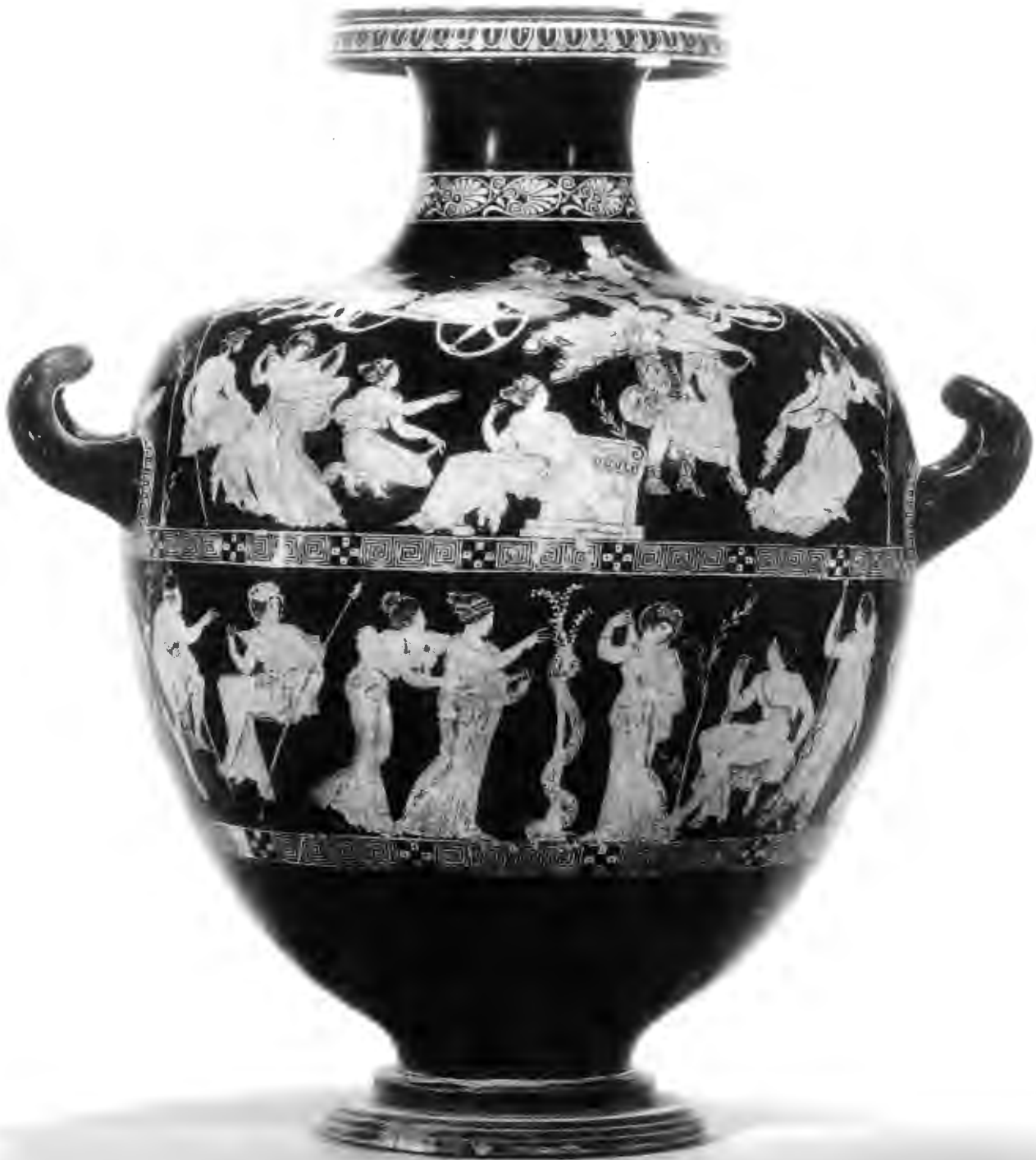
Figure 12. Attic red-figure hydria by the Meidias Painter. London, British Museum E 224.

to a choregic monument. 74 These possibilities, however, are not supported by the evidence. Attic funerary monuments do not represent gods or heroes, except Hermes, and choregic monuments are not known to have illustrated more than a single winning poem. 75 An alternative interpretation sees them