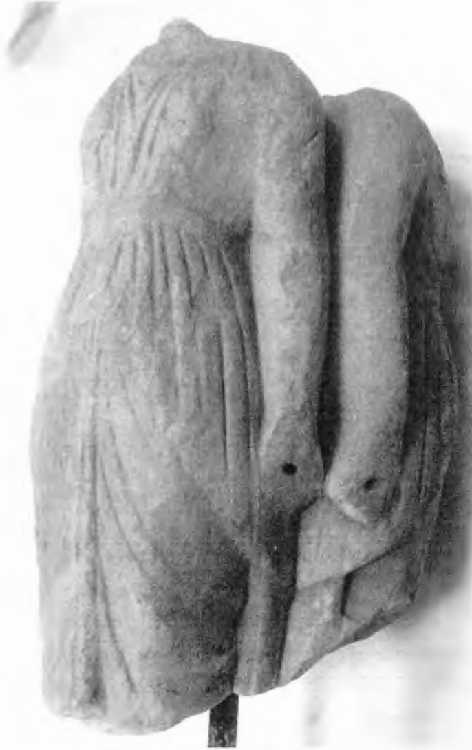
Figure 3. Triple Hekate. Athens, British School at Athens S 21. Photo: Olga Palagia. Reproduced with permission of the British School at Athens.

century B.C., is archaistic in its rigid frontality and must reflect Alkamenes' image. 13 A number of small-scale marble copies from the Athenian Agora and a hekataion of uncertain provenance now in the British School at Athens (Fig. 3), all dating equally from the first century B.C. – first century A.D., reproduce the same type of three frontal figures standing back to back like xoana around an invisible pillar. 14 Artemis Epipyrgidia is described as πυρφόρος in IG II 2 5050 and probably held torches as shown on the New Style silver tetradrachm and as implied by the holes in the hands of the British School Hekataion (Fig. 3).