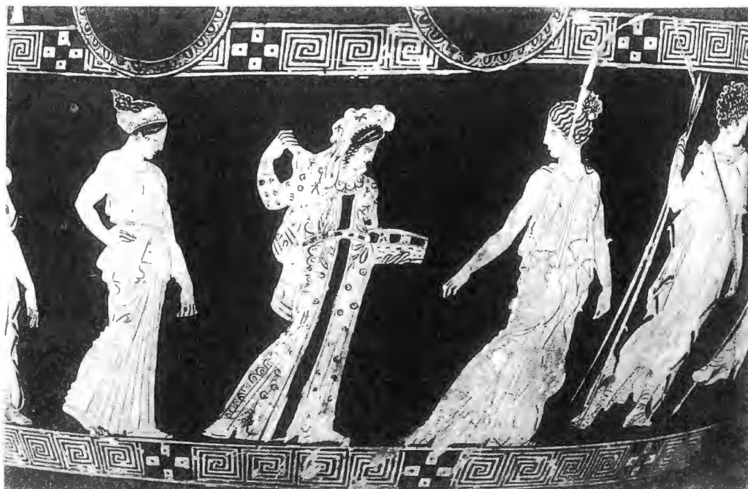
Figure 13. Attic red-figure hydria by the Meidias Painter. London, British Museum E 224. Detail: Medea.

as flanking the entrance of a sacred precinct. 76 Because of the predominance of Herakles imagery, Evelyn Harrison has assigned them to the precinct of the sanctuary of Herakles at Melite. 77