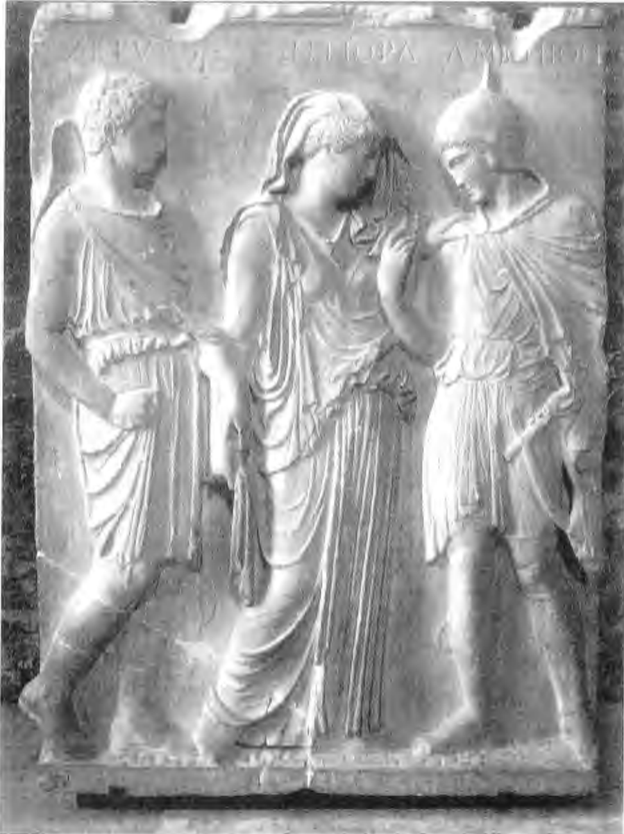
Figure 15. Three-figure relief of Hermes, Eurydice, and Orpheus. Paris, Louvre MA 854.

Epikourios at Bassai (carved c. 415–410 B.C., possibly by Athenian sculptors) also carries Orpheus playing his music. 83