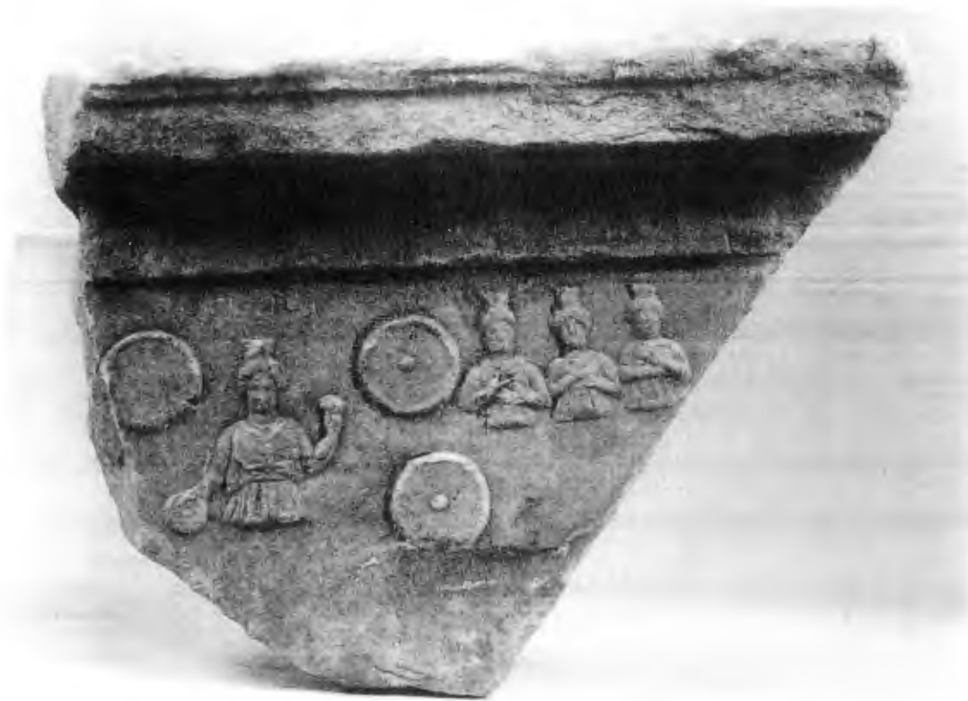
Figure 6. Fragmentary votive relief with the Graces and Athena. Athens, Akropolis Museum 18143.

unknown provenance and uncertain date, now in a private collection. 38 That their shrine was an important religious landmark of the city is attested by a fragmentary document relief of the fourth century presumably decorating a decree associated with the cult of the Graces on the Akropolis (Fig. 8). 39 On all these reliefs (Figs. 6–8), the Graces are invariably shown as half figures, implying that they are chthonic deities, rising from the ground. The position of their arms varies: they can be extended or held tightly against their breasts. Figure 6 shows the Graces and a half figure of Athena alongside three phialai depicted as if hanging from a wall, which suggests that all these figures are in relief.