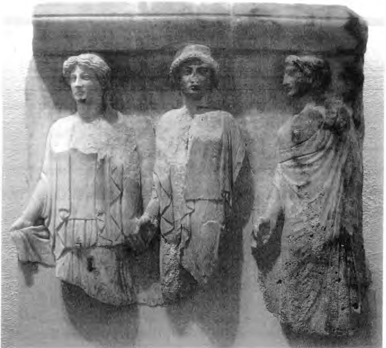
Figure 4. Neo-Attic relief of the so-called Graces of Sokrates, here identified as nymphs. Piraeus Museum 2043.

stylistic traits is typical of the Severe Style; the Neo-Attic copies (Figs. 4,5) must therefore draw on a work of the first half of the fifth century.