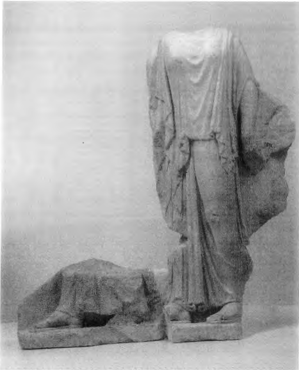
Figure 5. Fragment of Neo-Attic relief of the so-called Graces of Sokrates, here identified as nymphs. From the south slope of the Athenian Akropolis. Athens, Akropolis Museum 1341+2594.

there and may have been moved to the rock to serve as building material in the Middle Ages. The Propylaia were conveniently used for storing antiquities in the nineteenth century.