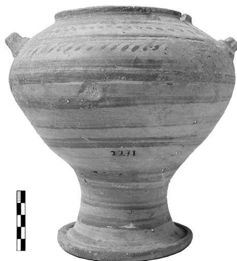
FIG.2. "STRAINER-PYXIS" FROM HOUSE A OF THE NW HILL, ZAKROS.