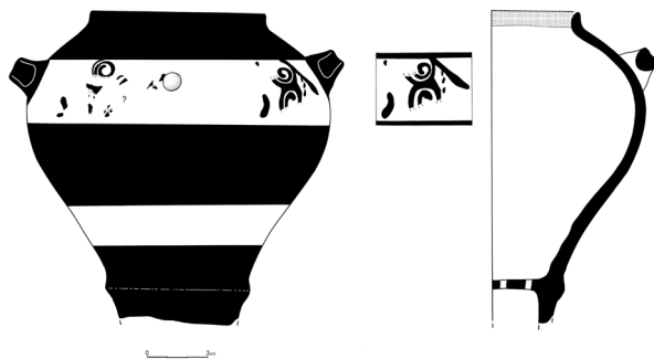
FIG.1. "STRAINER-PYXIS" FROM ZAKROS, BUILDING B