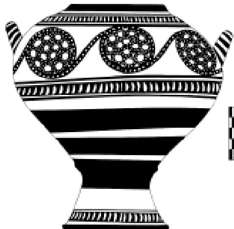
FIG.8. A BEAUTIFULLY DECORATED "STRAINER-PYXIS".