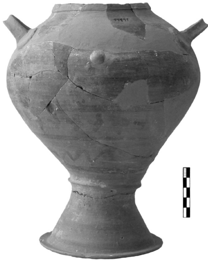
FIG.3. "STRAINER-PYXIS" FROM ZAKROS, BUILDING B.