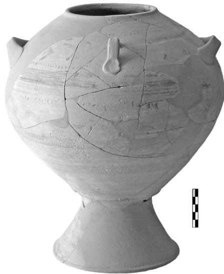
FIG.4. "STRAINER-PYXIS" FROM THE BUILDING OF POTTERY DEPOSITS.