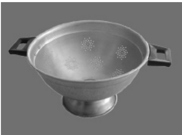
FIG.7. A MODERN "COLANDER" PRESENTING SIMILARITIES WITH THE "STRAINER-PYXIS".