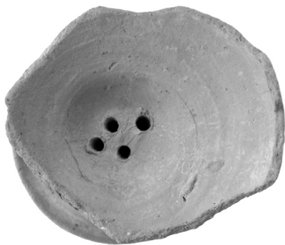
FIG.5. THE INTERIOR OF A "STRAINER-PYXIS".