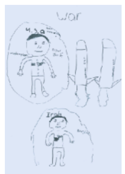
Fig. 1: Yarif (9): Bush and the USA are fighting with American missiles against Saddam and Iraq.

from, and he does it to people he wants to kill and he cuts off their hands and legs."