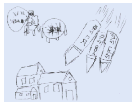
Fig. 4: Irit (9): On the left top a female figure with a tape recorder playing the sound of a siren. Various missiles are firing on residential buildings.

Girl: "Saddam'ele [loving suffix], come let's not make war, we need to talk about our wedding and to spend time together." Saddam: "You are right sweetie, can you bring me a glass of wine?"