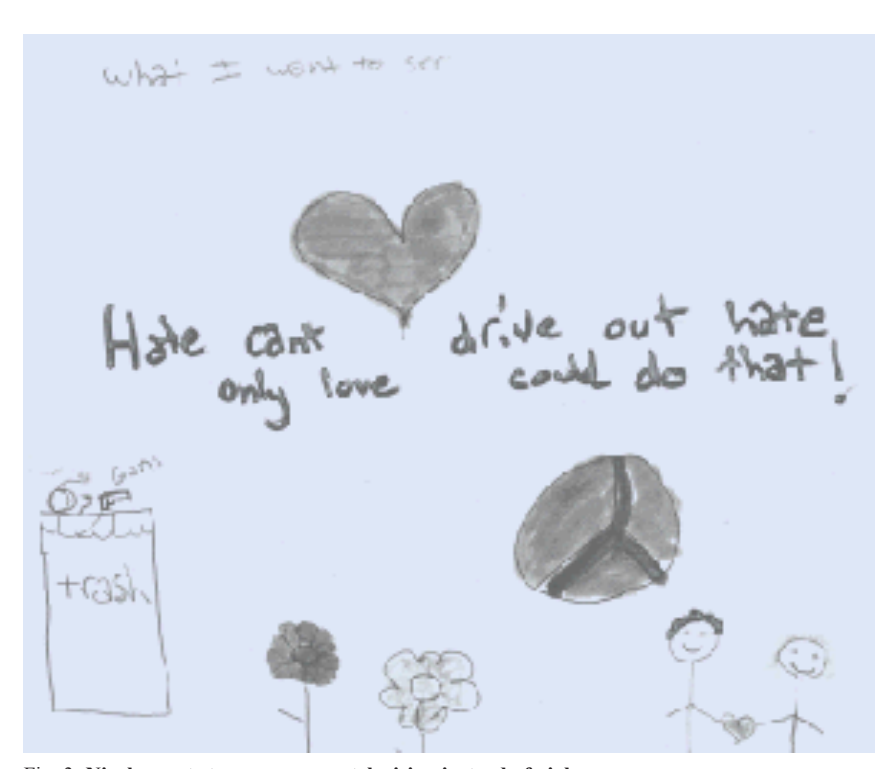
Fig. 3: Nicole wants to see peace on television instead of violence.

All boys were more outspoken than girls about their opinions on the war, and tended to be enthusiastically procombat. The boys mostly conceived of the war as a personalised conflict between George Bush and Saddam Hussein, one that had involved a series of verbal threats and warnings by the United States. When Saddam Hussein ignored these, he deserved the kind of beating he would receive in return. In this scenario, there was no consideration for the Iraqi civilians or military, although US servicemen figured heavily. War and soldiers are the focus of the drawings (see Fig. 1).