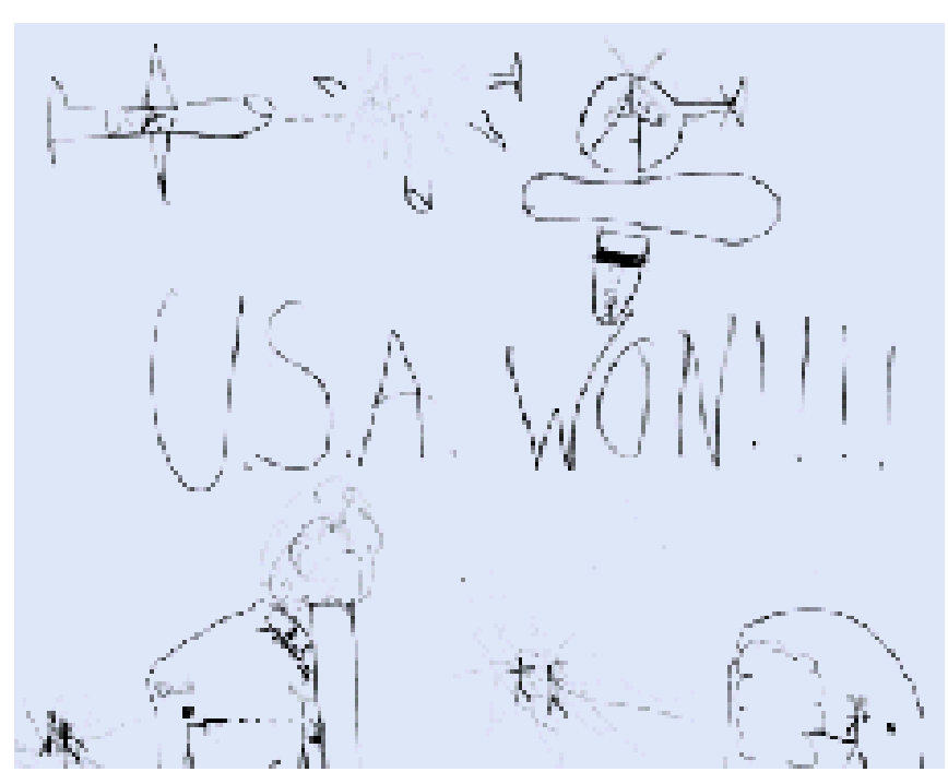
Fig. 4: In Sean's drawing the USA are shown as the victorious power. The American airforce destroys the Iraqi air planes. On the ground one man – taking a pee – gets stubbed and someone shoots off his head. Bush himself shoots at Saddam with a machine gun.

and another kid and him, and Bush [comes?] in with a machine gun and up there we're destroying the air force planes and right there US is inside a 'copter and destroying it and it says "US Won!". That's what I'd like.