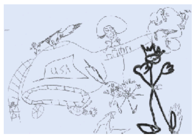
Fig. 1: In Ryan's drawing an American tank is going to Iraq and sees Saddam's warriors. It is crushing them, shooting them, finally throwing them up in the air and destroying them with a missile. Behind the barrel of the gun one can see the different parts of Saddam's torn body.

"Handle your own emotions constructively," one local paper instructed.13 "A child will learn so much by modelling your feelings," said Dr. Brazelton, child expert for the NBC broadcasting network. "You can gently talk to children about your own fears so that they can see that you can face them and carry on."14 Experts advised parents to limit their own TV watching and to avoid engaging in any heated, adult conversations about the war until after children have gone to sleep. A couple of experts, although not the majority, warned parents to monitor their own use of stereotypes or slurs when discussing the war around children.