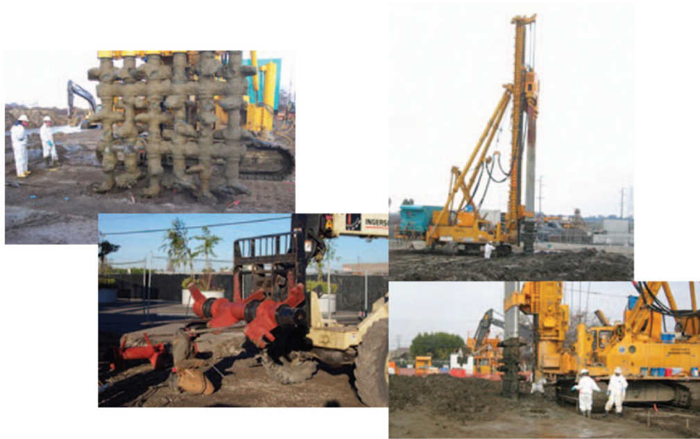
Figure 3. Amendment application by soil mixing using large-scale augers at an arsenic-contaminated site. A sulfate–cement slurry is injected as the augers are advanced into the soil, thoroughly mixing the amendments with the contaminated soil.