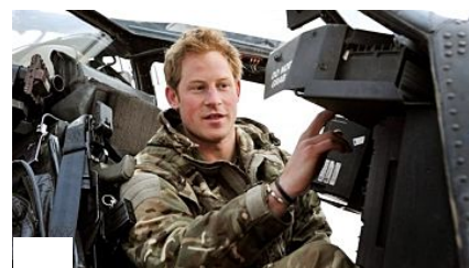
Prince Harry set to leave Army