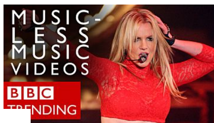
Music videos without the, um, music