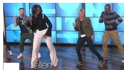
Michelle Obama shows off her moves