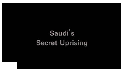
Saudi's Secret Uprising