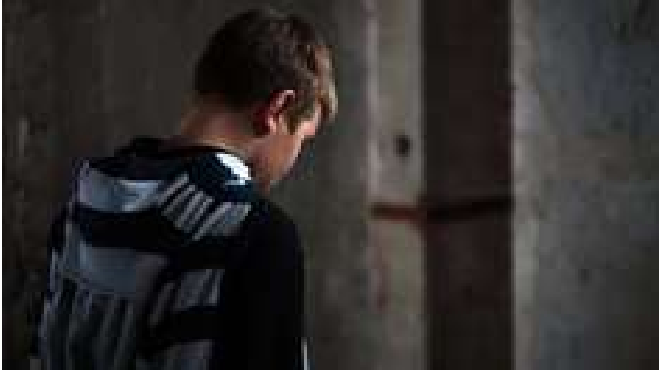
Child mental health 'faces overhaul'