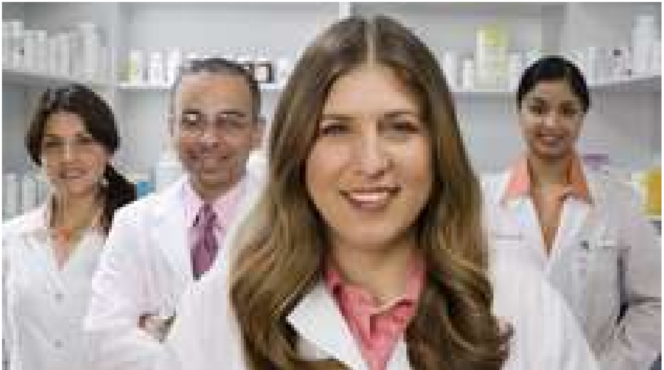
'Army of pharmacists' to help GPs