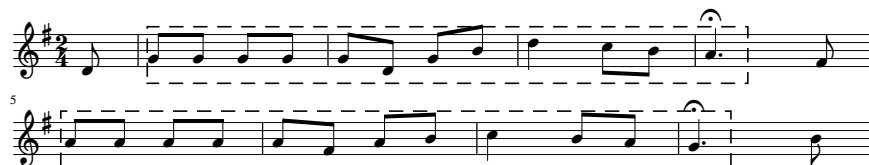
Fig. 1. First two phrases of the melody Begiztatua nuen 1 . The two phrases are related by an abstract melodic contour relation and there is no transposition that carries one into the other.

Progress on the coherence problem was made recently in the music generation method of Collins et al. [6], where similar segments are identified by patterns indicating transposed repetitions in Chopin mazurkas. These “geometric” patterns are only suitable for carefully selected examples, because repetition in music need not be restricted to rigid transpositions. Consider, as an illustration, the simple melodic fragment of Figure 1. Though the two indicated phrases are clearly related, apparent in the score and to any listener, this is not by sharing an interval sequence, but rather an abstract contour sequence. The method described in this paper is able to naturally handle such musical phenomena using heterogeneous patterns discovered automatically using various viewpoints.