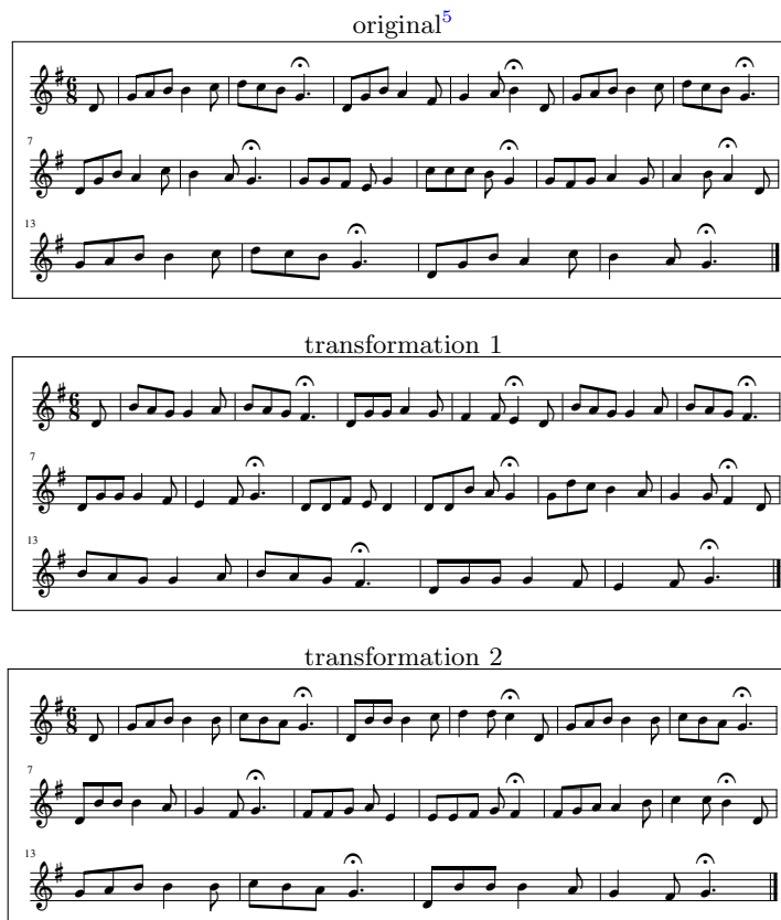
Fig. 5. Three pieces performed at the London concert.

lower (15%, with 37.5% not confident in their response) audience result for that transformation.