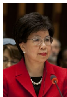
Margaret Chan WHO Director-General

The framework for Europe is closely aligned to WHO's Twelfth General Programme of Work and is a practical expression of a programme of reform in WHO that seeks to enable the Organization to respond to Member State needs more effectively in a rapidly changing world. In the European Region, as in other regions, the outcomes envisaged in this policy framework require that international organizations be able to work not just with selected sectoral ministries but across all relevant parts of government; with colleagues in other international organizations that influence health; as well as with industry, academe and civil society. The policy framework for Europe signals the way forward for new approaches to health and well-being worldwide.