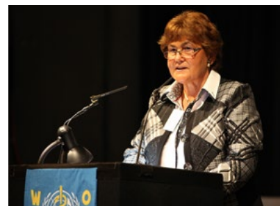
Zsuzsanna Jakab WHO Regional Director for Europe

I believe Health 2020 can add significant value to all of our individual and collective work to enhance health and well-being, serve as unique resource to enhance the future and prosperity of individual countries and the Region as a whole and benefit all its peoples. Actively informing and aligning our daily practice with Health 2020 values and approaches will enable us to build a healthier Europe for ourselves and our children.