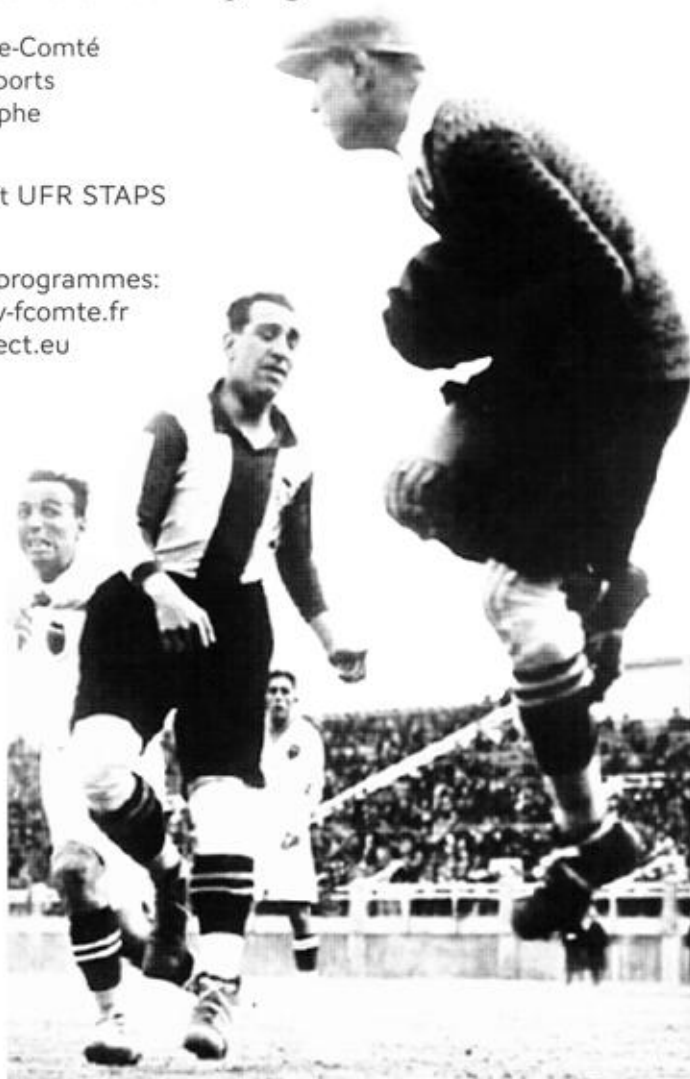
“The origins and birth of European football” conference poster (design: Dàvid Ranc)