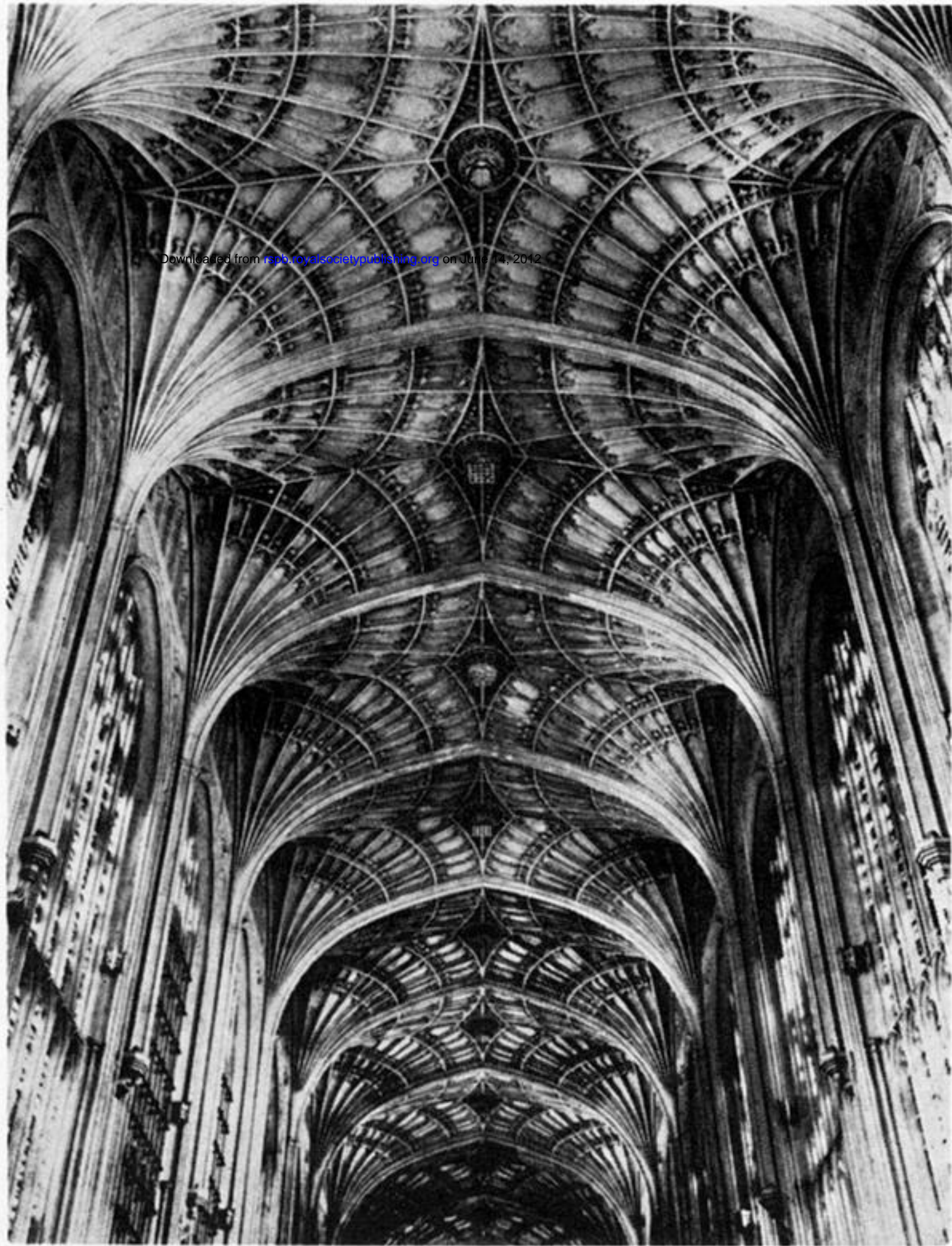
FIGURE 2. The ceiling of King's College Chapel.