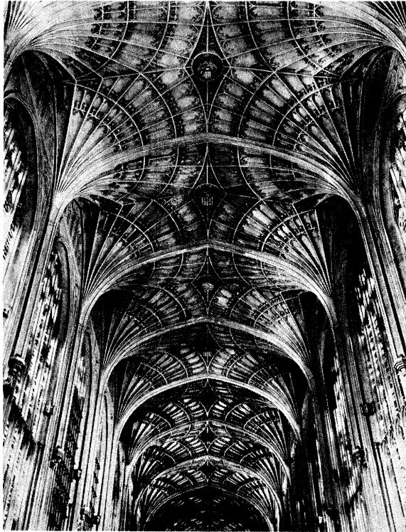
FIGURE 2. The ceiling of King's College Chapel.

the Tudor rose and portcullis. In a sense, this design represents an ‘adaptation’, but the architectural constraint is clearly primary. The spaces arise as a necessary by-product of fan vaulting; their appropriate use is a secondary effect. Anyone who tried to argue that the structure exists because the alternation of rose and portcullis makes so much sense in a Tudor chapel would be inviting the same ridicule that Voltaire heaped on Dr Pangloss: ‘Things cannot be other than they