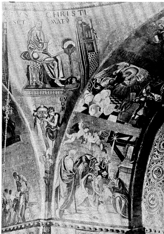
FIGURE 1. One of the four spandrels of St Mark's; seated evangelist above, personification of river below.

The design is so elaborate, harmonious and purposeful that we are tempted to view it as the starting point of any analysis, as the cause in some sense of the surrounding architecture. But this would invert the proper path of analysis. The