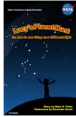
(/story-lucy) Lucy's Planet Hunt . . . (/story- lucy)