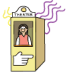
(/magic-windows) Explore the Electromagnetic Spectrum (/magic-windows)