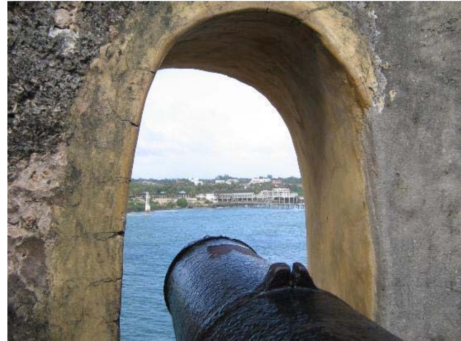
Fort Jesus, Mombasa, Kenya