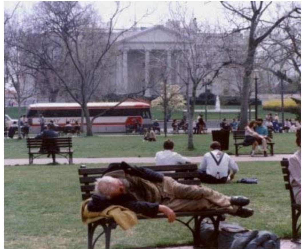
The White House, Washington D.C.