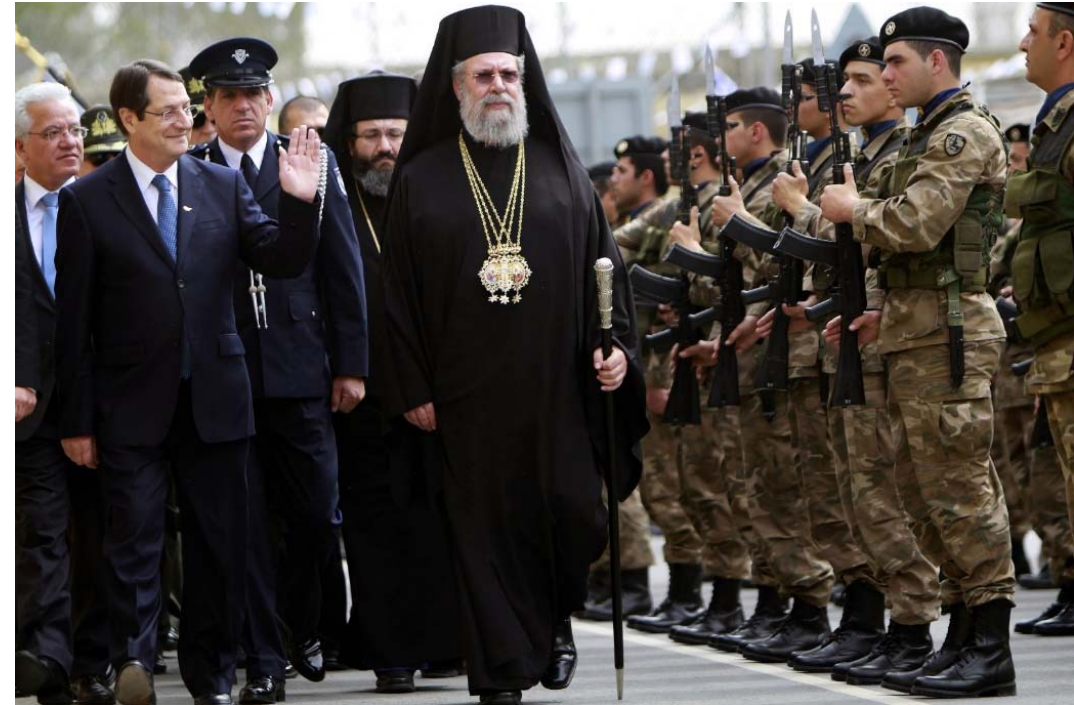
The Cypriot archbishop Chrysostom (+2022)