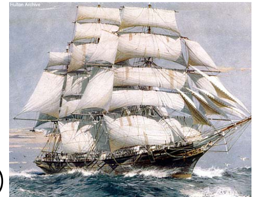
Cutty Sark 1869