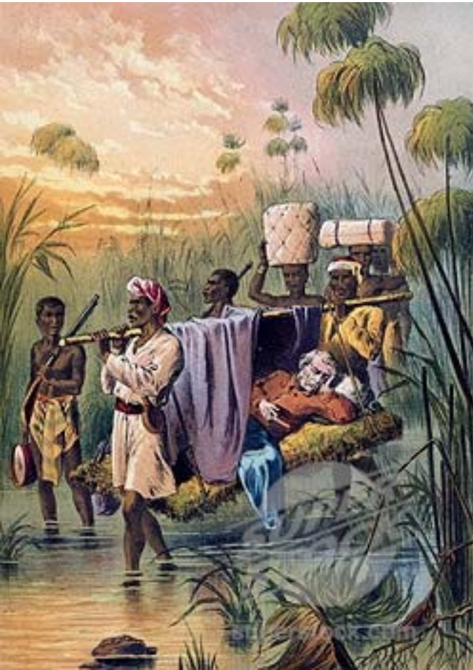
David Livingstone (1813-1873), a Scottish missionary and explorer carried the "last mile" to die in his home in Ujiji, Tanganyika.