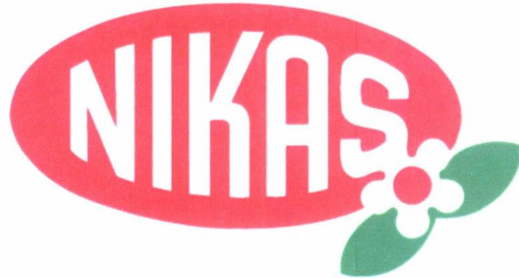
NIKAS SA well known mark